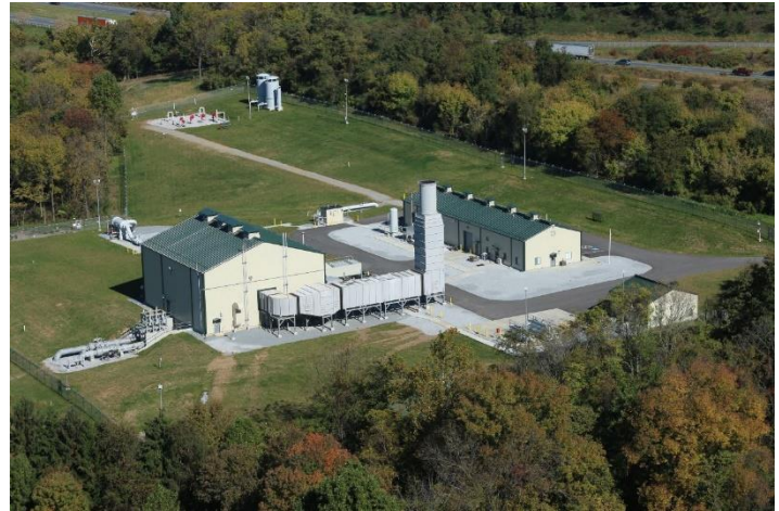
The EGTS Meyersville Compressor Station in Maryland.

The system is nationally regulated by the Federal Energy Regulatory Commission (FERC), the Pipeline Hazardous Material Safety Administration (PHMSA) and the Environmental Protection Agency (EPA), as well as a number of state agencies.