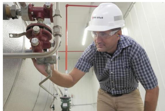
An employee performs a maintenance check at an EGTS facility.