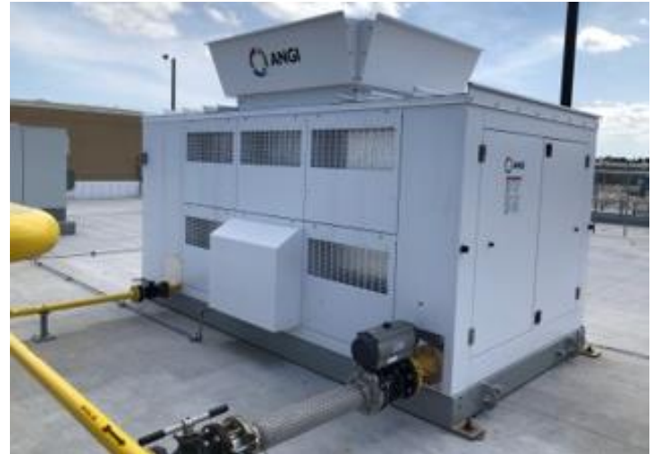
Georgetown RNG Injection Point in Georgetown County, SC

In 2021, CGT received the American Gas Association (AGA) safety award for employment and vehicular safety. The system is nationally regulated by the Federal Energy Regulatory Commission (FERC), the Pipeline Hazardous Material Safety Administration (PHMSA) and the Environmental Protection Agency (EPA), as well as a number of state agencies, including the South Carolina Department of Health and Environmental Control (SCDHEC).