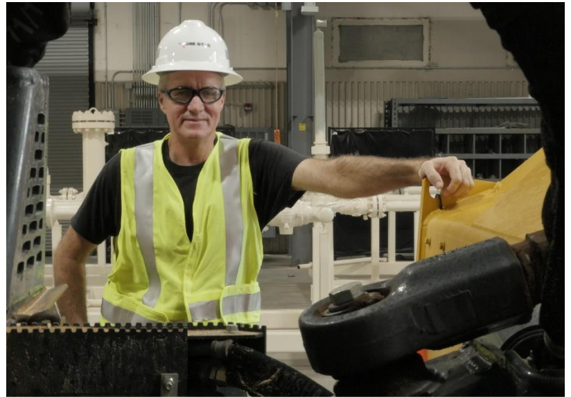
A CGT employee checks the safety of equipment in the facility garage in Columbia, SC

Following a Berkshire Hathaway Energy acquisition, became Carolina Gas Transmission, an operating company of BHE GT&S